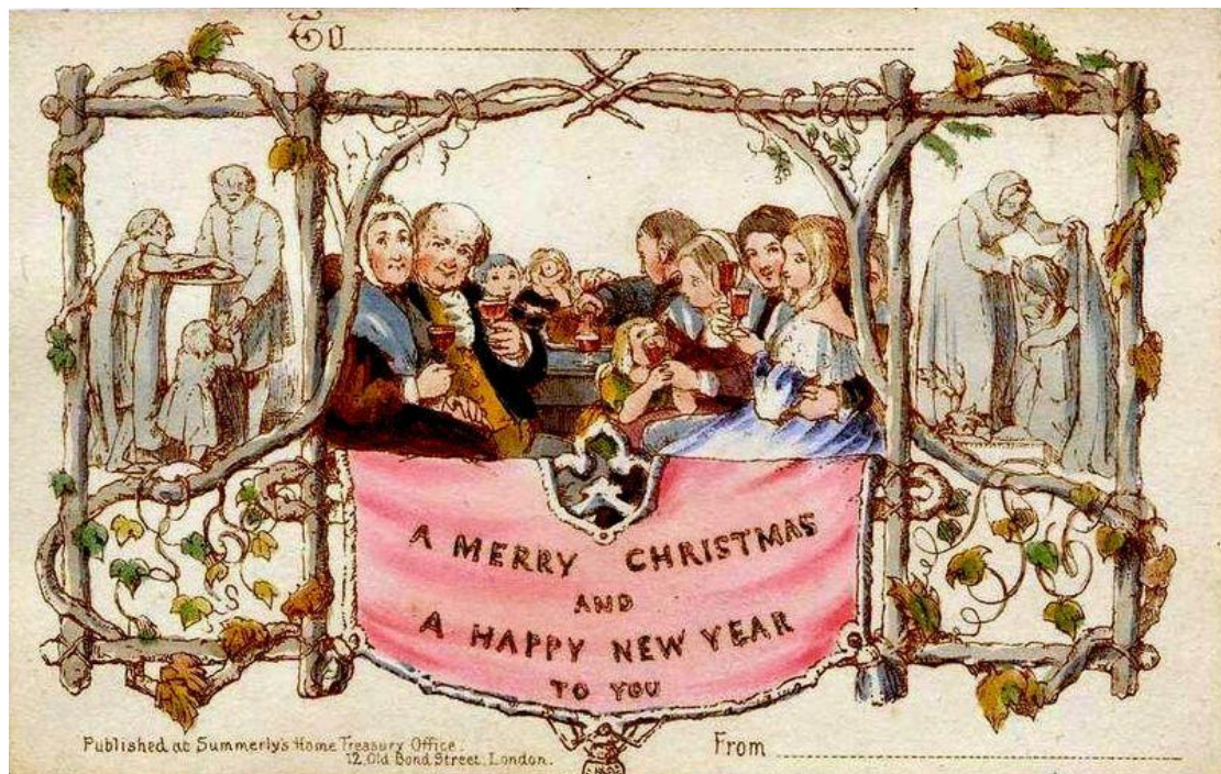
The 1 st Commercial Christmas Card (1843)